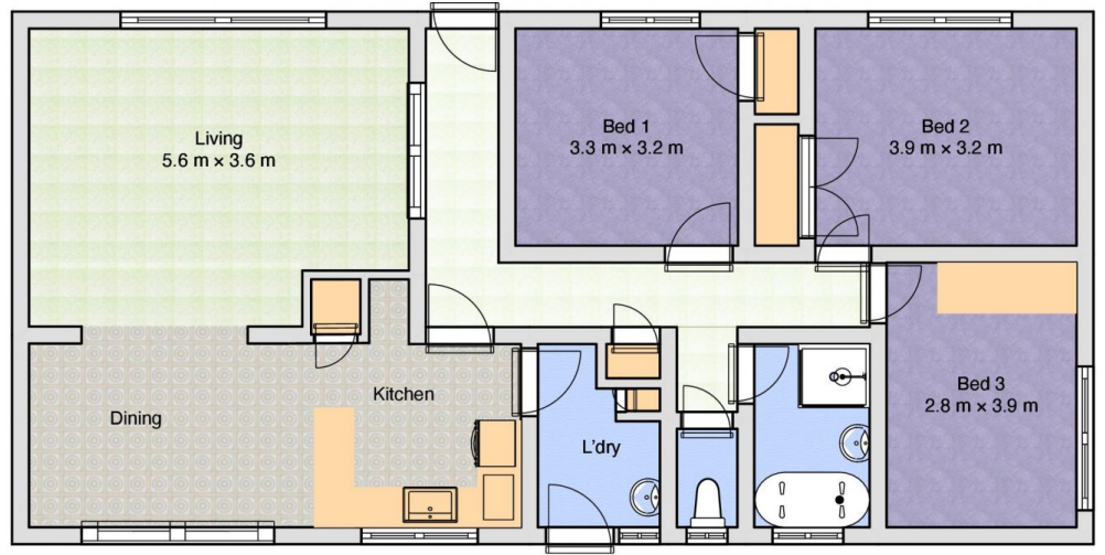
1 Schultz Ct, Wodonga