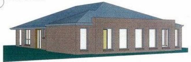
5 Back Left