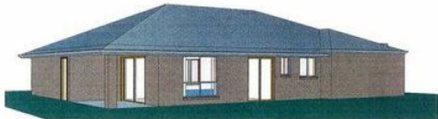
4 Back Right