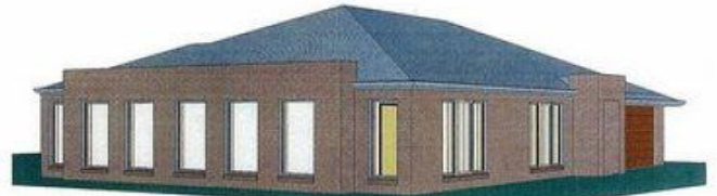
3 Front Left