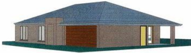
2 Front Right