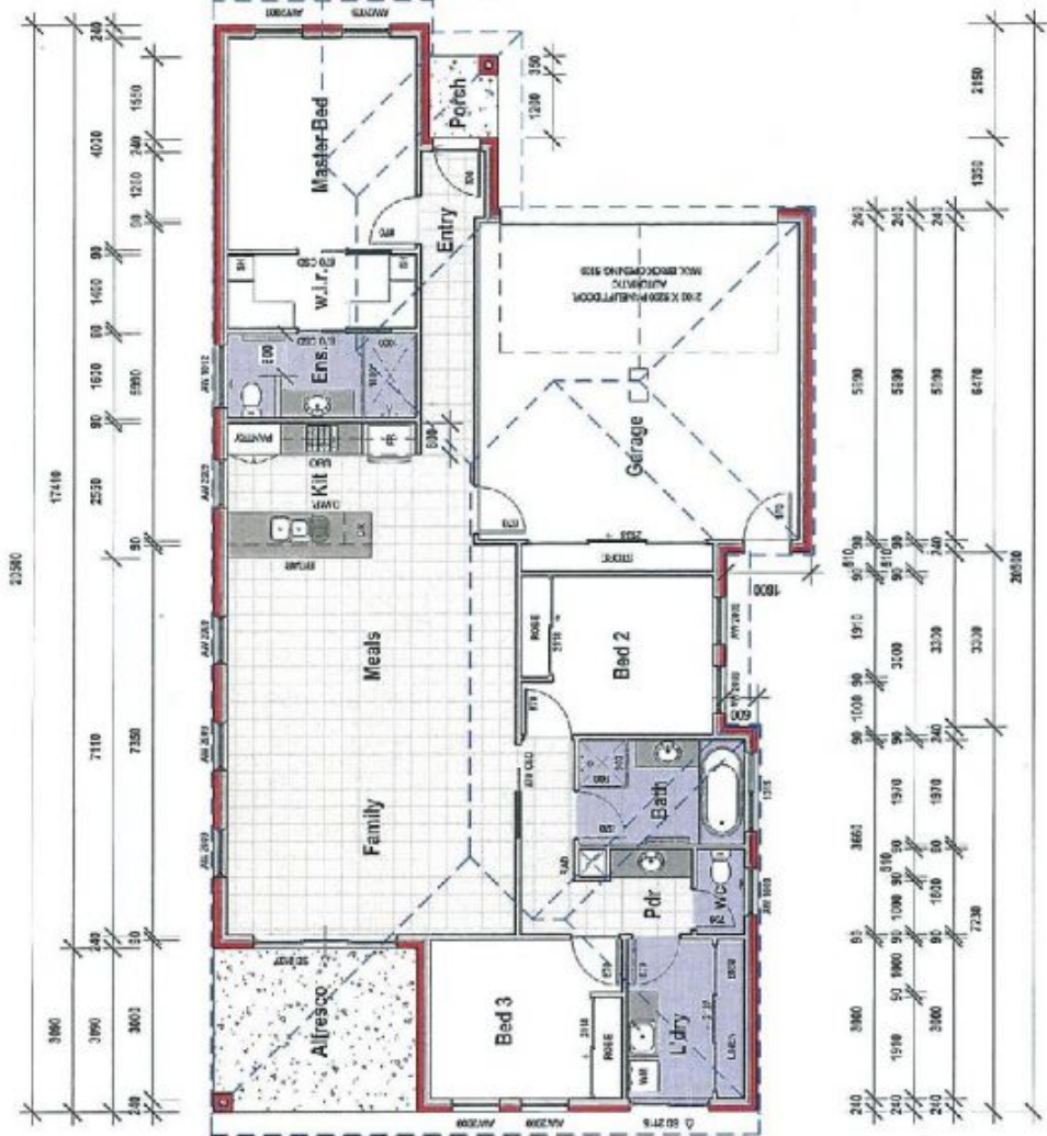
1 Ground Floor 1:100

WARNING: This is the sole property of Cavalier Homes Albany/Wodonga Pty Ltd, and may not be used in whole or in part without written or formal consent from Cavalier Homes Albany/Wodonga Pty Ltd. Legal action will be taken against any person's infringing the copyright.