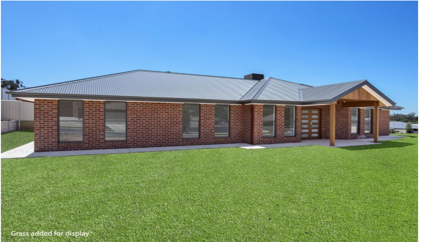
Grass added for display