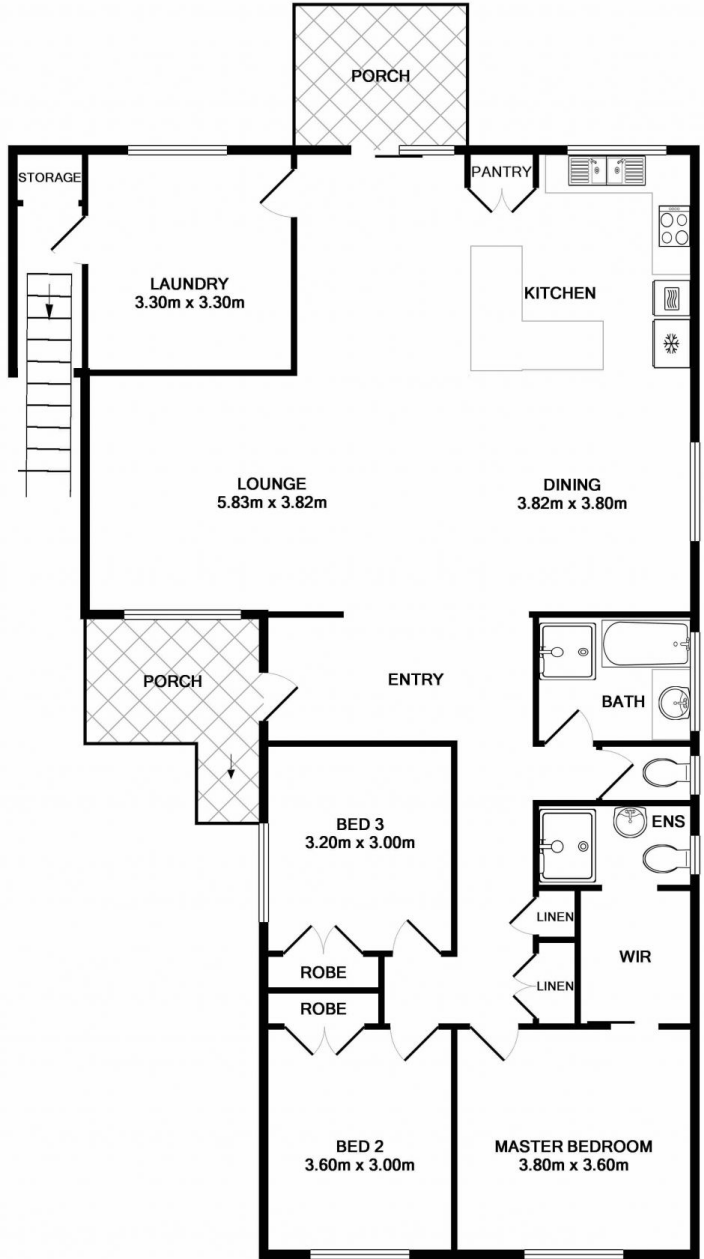
1ST FLOOR APPROX. FLOOR AREA 143.5 SQ.M. (1545 SQ.FT.)