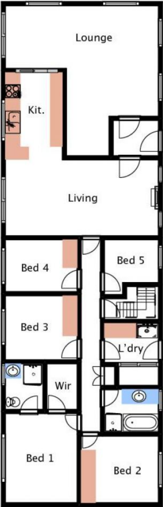
13 Barton Drive, Baranduda